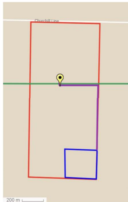
Figure 1: Enniskillen BESS Scale Site Map